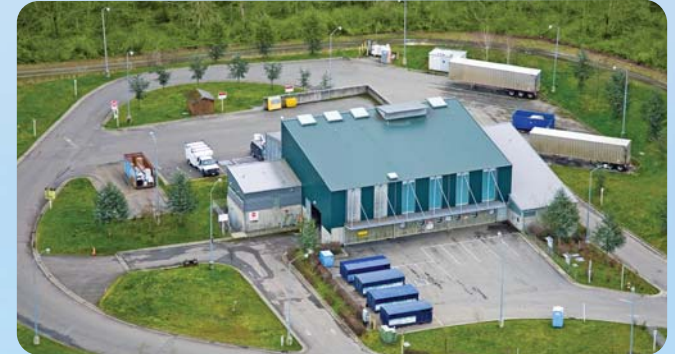
Vashon Recycling & Transfer Station